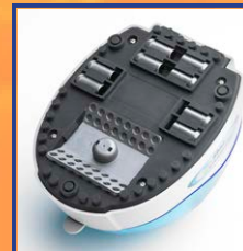
On-board storage in base for PCR rotor and adapters