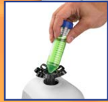
Vortexing a 50ml tube in the Mortexer™